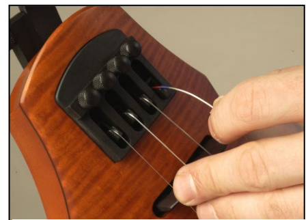
Insert String Through Tuner