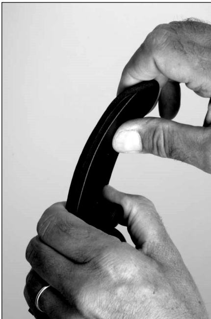
Bending the Shoulder Rest Plate

The clamp on the shoulder rest adjusts the angle and location. When a comfortable position is achieved, tighten both knobs to prevent movement.