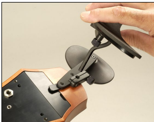
Insert Shoulder Rest