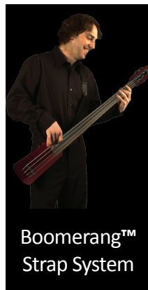
Boomerang™ Strap System