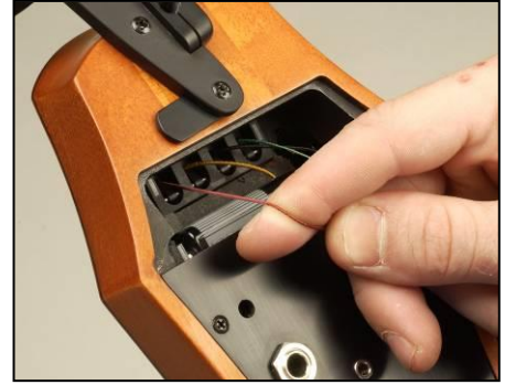
Pre-Tension Perlon Strings

The body extension (bout) provides the conventional position reference for the left hand. It is easily removable with the single screw located at the back of the neck.