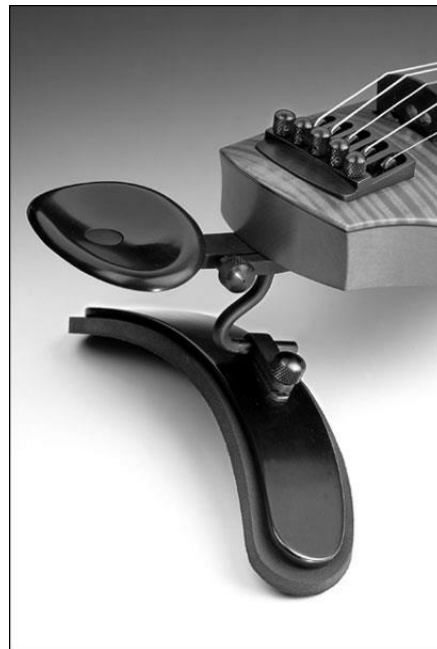
Chin and Shoulder Rest Assembly