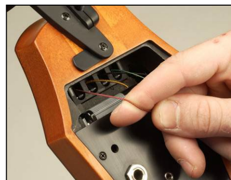
Pre-Tension Perlon Strings