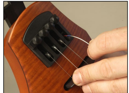
Insert String Through Tuner