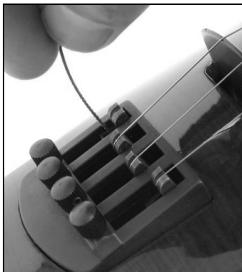
Insert String Through Tuner