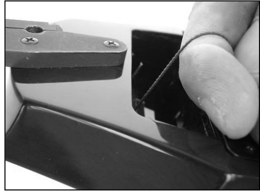
Pre-tension Synthetic Core Strings

To pre-tension string: After the string is inserted into the tuner, rotate the tuning knob clockwise until the string just begins to clamp (when the string can no longer be pulled out of the tuner). Pre-tension the string by pulling the string firmly through the tuner from the back. The string must be pulled strongly enough so that the resulting pitch of the pre-tuned string is less than a fifth below the correct pitch. For example, the D string must be pre-tensioned to A or higher. In this way the correct pitch can be achieved within the range of the tuning mechanism. This procedure should be repeated if the final pitch is not reached. The string ends may be wrapped around a pencil or similar object to grip the string so greater pulling force can be applied.